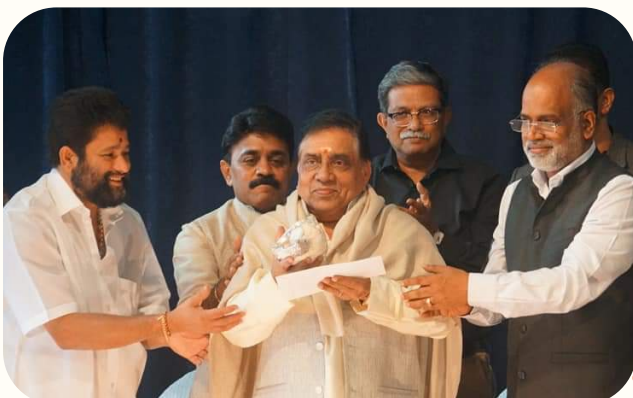
Receiving award from the International Centre for Kathakali, Delhi.