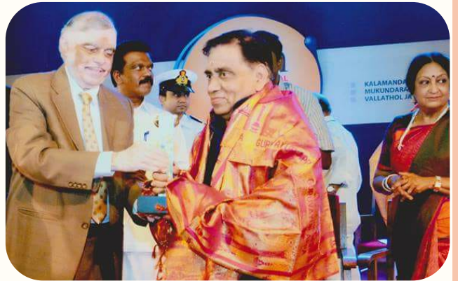
Falicitation By Kala Sagar, 2013