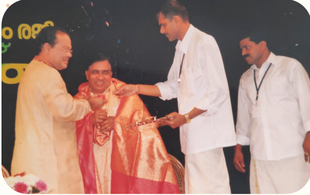
Falicitation by renowned malayalam cinema actor Shri. Innocent In Chandigarh.